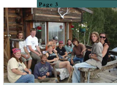
Mission: Wolf staff and 2006 SCI International Workcamp participants flash a smile.

We simply answered: "just bring your tent, food, gloves and boots." Soon there were so many volunteers that volunteers were needed to coordinate and teach oth-