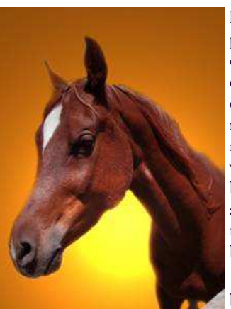
Egyptian Arabian horses are one of the most ancient of the horse breeds in the world. Their behavior and structure is one based on survival. Like the wolf is to our domestic dog so is the relationship of this ancient breed to many of our domestic horses of today.

Who would ever think that wolves and horses have anything in common? After all, why would they? One is a predator and the other is dinner, or prey. I intend to demonstrate that at a basic level they are more similar than one may expect. My new book will delve more deeply into this idea, but here is an insight into the world of working with wolves and horses in similar ways.