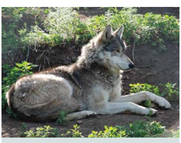
Daisy the Wolf-Dog

Now she gets excited and lets out a squeaky howl of her own.