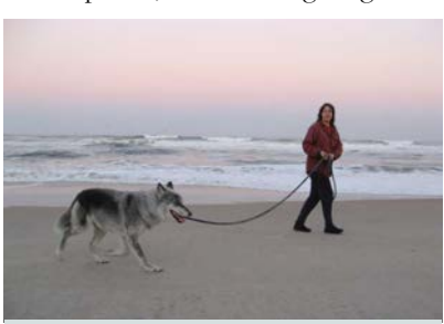
The lunge is helpful to the handler and provides clear leadership. Note how both horse & wolf strides are in time with the leader, Tracy.

In order to better serve wild wolf education, we strive to deliver presentations with wolves that demonstrate calmness and confidence, allowing the wolves to behave as naturally as possible; yet we also need the ability to keep up with them. It is no easy job working with wolves in the public, and traveling long distances requires sacrifice on both humans and animals.