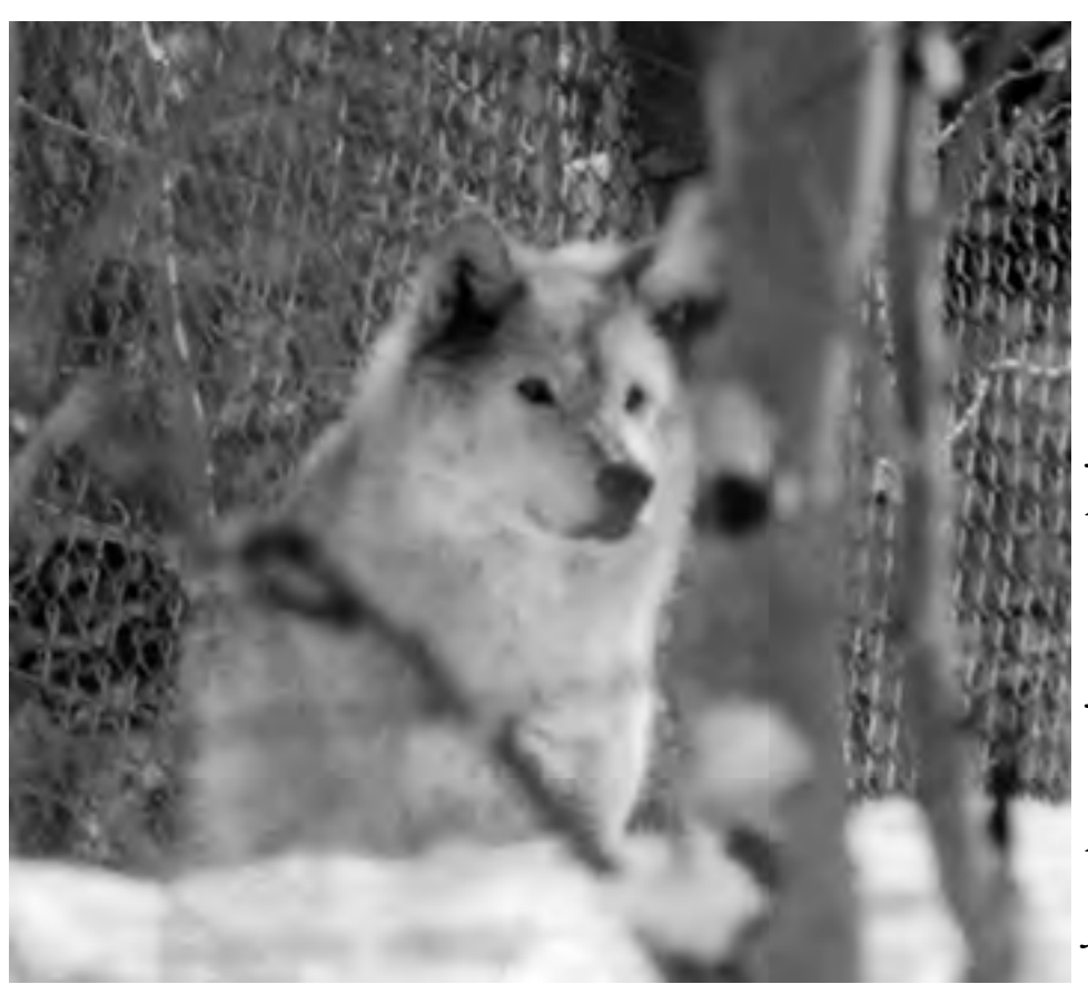
Mera warily observes visitors from her hilltop perch.