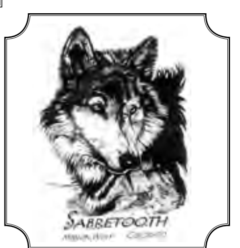
THE NEW MISSION: WOLF T-SHIRT AN ORIGINAL DESIGN BY TRACY BROOKS FEATURING RESIDENT WOLF SABRETOOTH