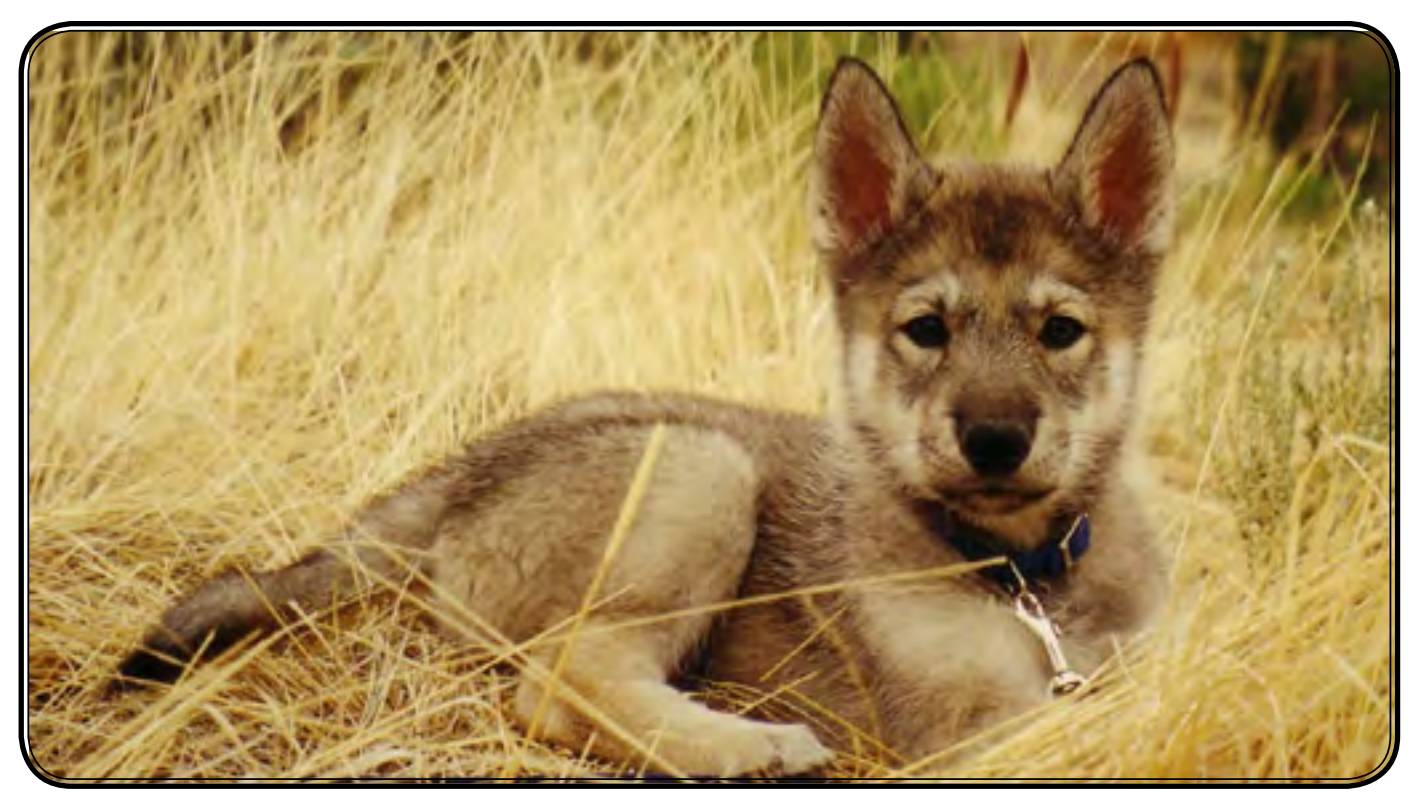
Luna looks so angelic and innocent, but we know better! It won't be long before she's rested and getting into trouble again.

Mission: Wolf PO Box 211 Silver Cliff, CO 81252