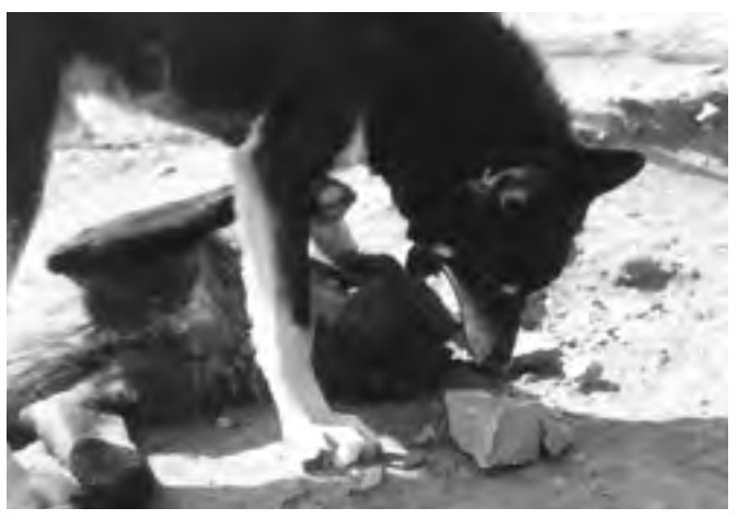
Hopi dominates Shaman as their food is prepared.

Mission: Wolf is thankful for both of your We are always looking for dependable, fuel efficient efforts and wish you the best in future adventures.