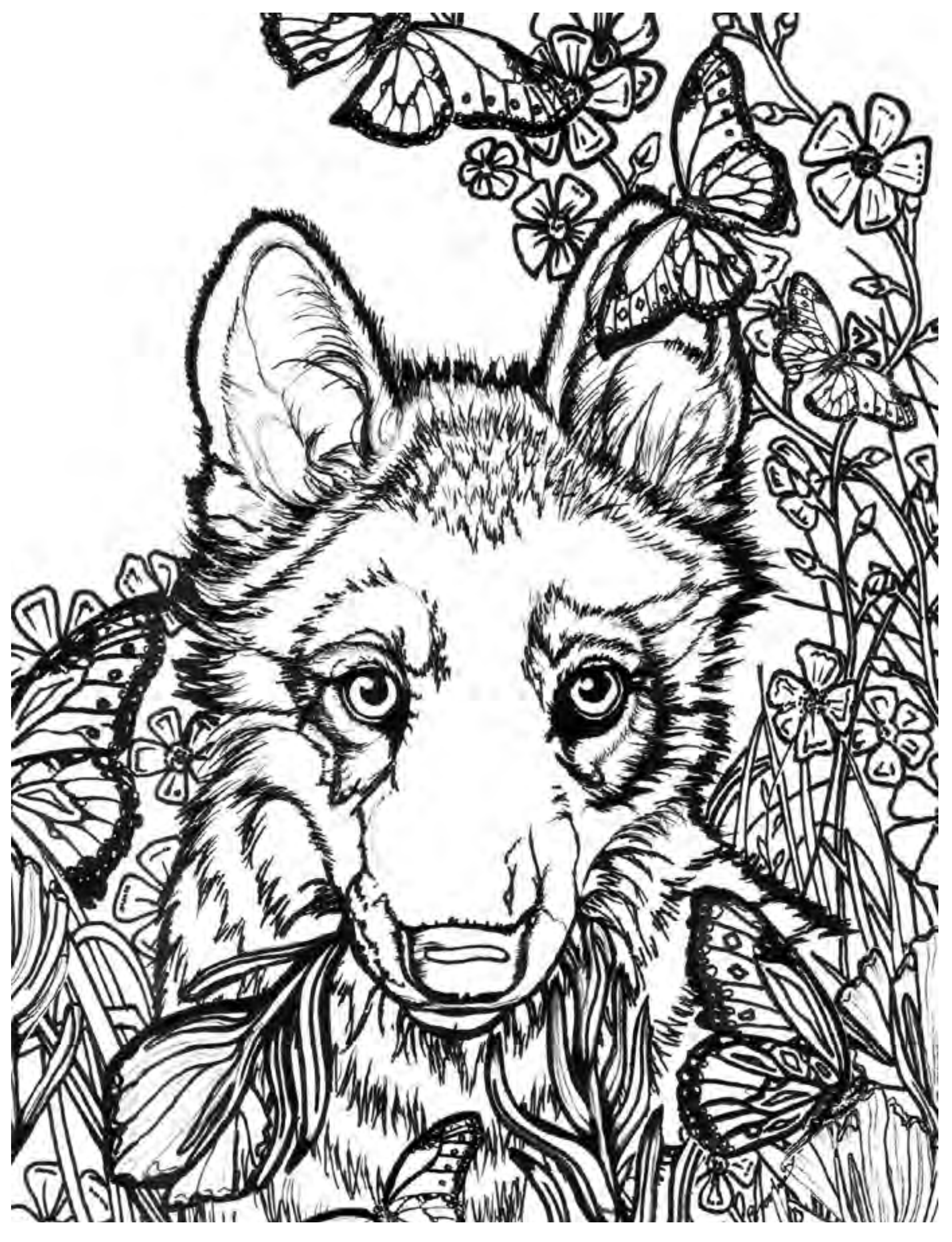
ORIGINAL ARTWORK BY TRACY ANE BROOKS

Baby Luna romps in the spring flowers. With eyes like butterflies, she pauses just long enough to inspire you to color in the precious scene.