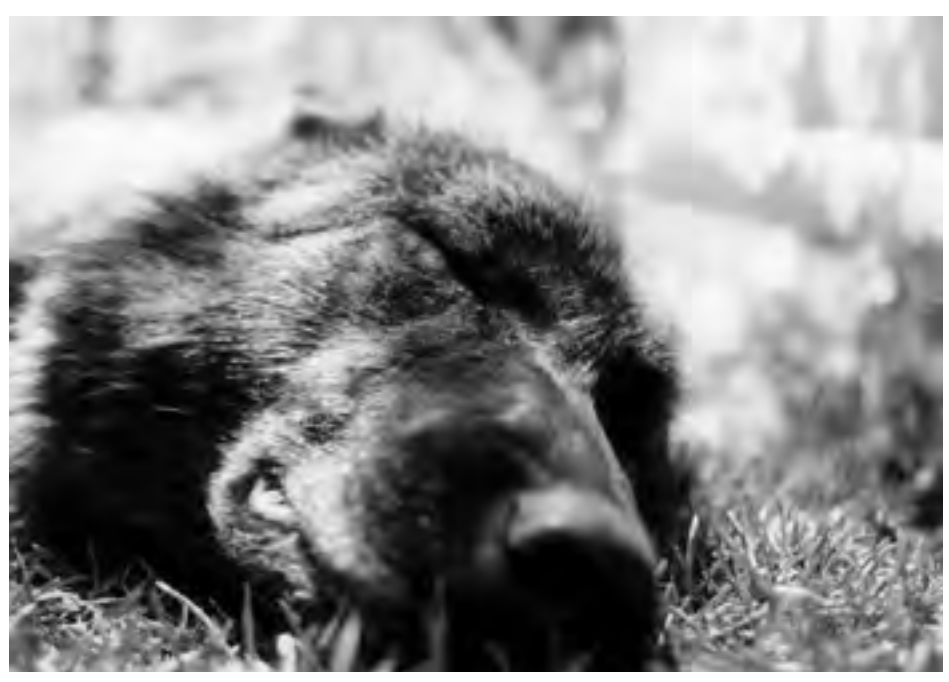
Rami peacfully sleeps in the early spring grass.

face to face truly motivates young students to come down and assist us in achieving our goals of wild wolf recovery and caring for wolves that have to live in captivity. Many other schools and colleges in Colorado were able to meet Rami, but as usual, the Wolfhound was unable to visit every school that requested a program-clearly indicating the need for this type of educational work.