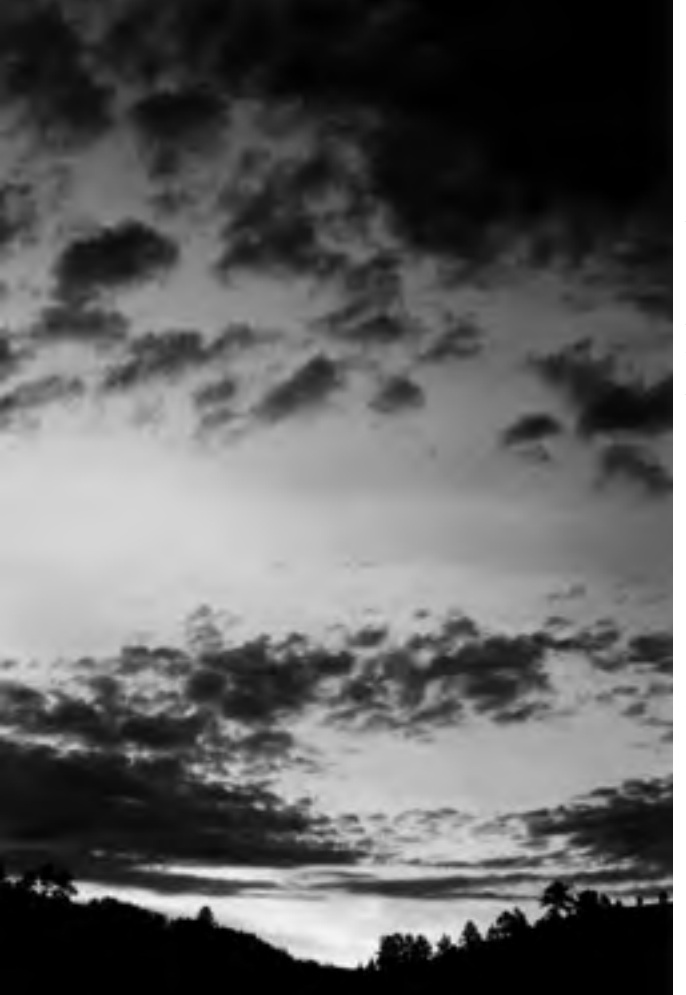
THE PROMITORY DIVIDE AT MISSION: WOLF.

LAND UPDATE Mission: Wolf has successfully secured 449 acres of land. Of this, 191 acres have been placed in the wolves' names. An additional 258 acres of adjacent land is privately owned and earmarked for conservation as soon as M:W has funds available. In total, Mission:Wolf has secured a 50 acre refuge, a 40 acre farm and 359 acres of habitat set aside for conservation. To assure the longterm future of the wolf refuge and protect vital wildlife habitat and watersheds, M:W has created a plan known as the Mission: Wolf Wilderness Preserve.