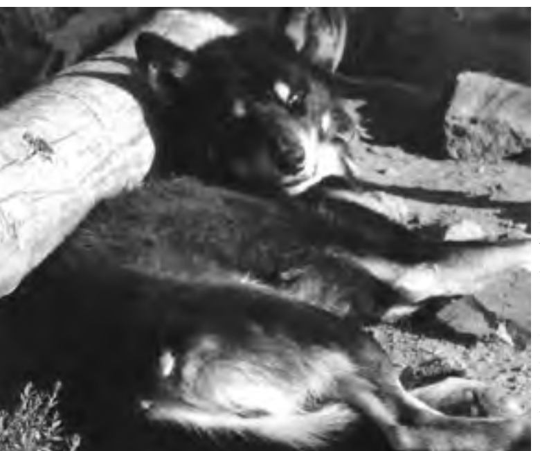
Hopi truly enjoyed basking in the warm sun.

passed away due to natu~ ral causes. Haida's soulful eyes, wild spirit and quiet howl will always be remembered. Hopi survived his beloved mate by nearly a year. He fought off the pain and frustration of loosing one of his front legs to bone cancer and continued to smile whenever anyone would pass. While it is often very difficult for such an old animal to recover from major surgery, Hopi's strength and perseverance was a testament to the incredible will and resilience of his species. Even with only three legs, Hopi would still tear the staff kitchen apart whenever we brought him inside for some extra attention. Beating all odds, Hopi survived until June 10, 2002, when he was tearfully relieved from his pain by his friends at Mission:Wolf. That evening, Hopi's spirit rose above the refuge and we know he is still looking down on us from the wild ridge above.