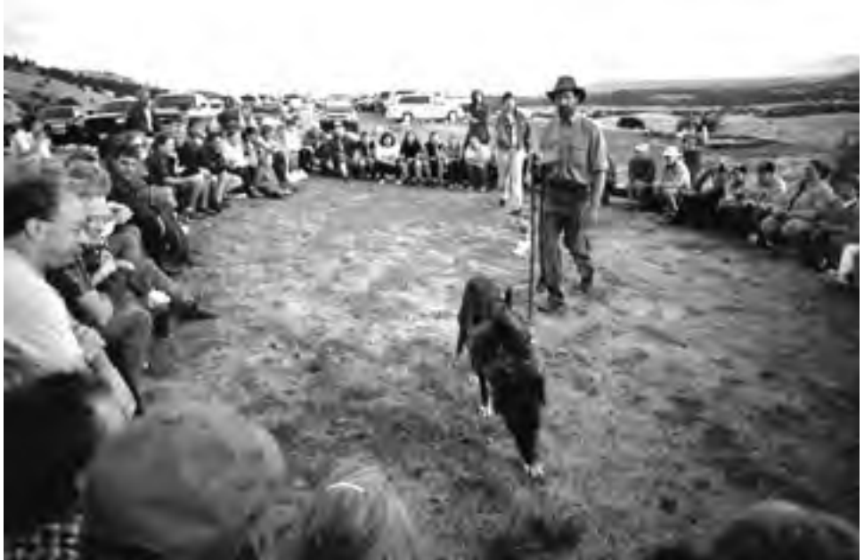
Ambassador Wolves Rami and Luna meet our guests eye to eye during Mission: Wolf's annual dinner.

After almost an entire month of speaking with children and others, it was finally time to be heading home. Rami sensed the homecoming feeling and