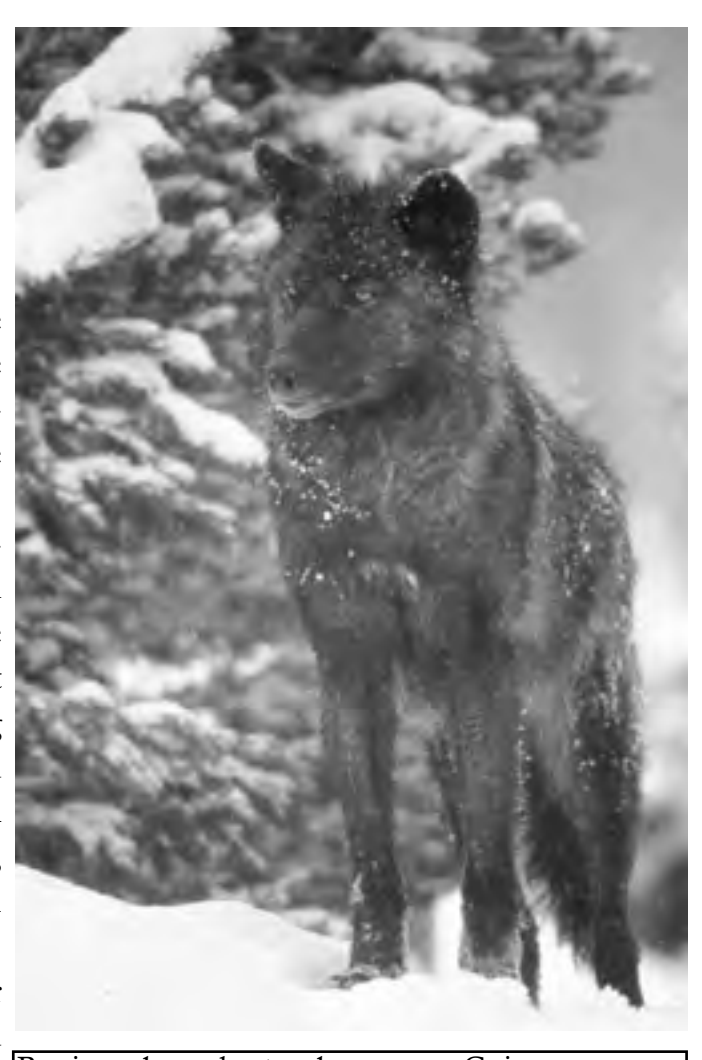
during the coldest of days.

She lived out the rest of her life in a large enclosure next to the Visitor's Center with Guinness. Passion adored people, but her jealous, overbearing companion found himself threatened by any human that gave her the attention she solicited. This always Passion always kept a close eye on Guinness, even resulted in the fiery little Passion charging Guinness and chasing him away from the people so she could continue enjoying the attention. She was by far one of the most