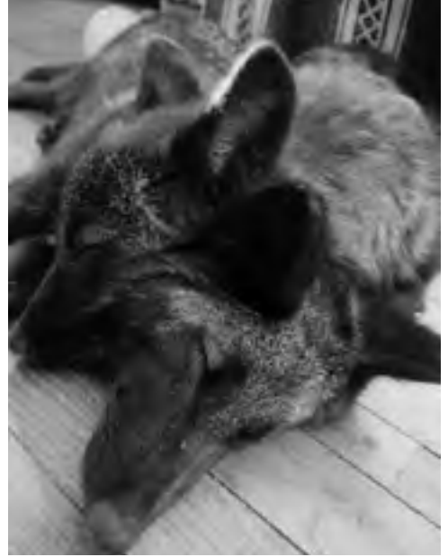
Raven and Magpie as they first arrived at Mission: Wolf.

Raven and Magpie were born on April 7, 2002, to a full British Columbian wolf father and a mother of half British Columbian and half Arctic wolf descent. Although they are believed to be pure wolves, their ancestors were sold as 98% wolf/dog and have been transported across state lines without wildlife permits. To the best of our knowledge their litter was intended for a movie project. Their two brothers are now in Utah being considered as possible filming candidates. Raven and Magpie ended up in the care of a private person in South Carolina who owned 34 other