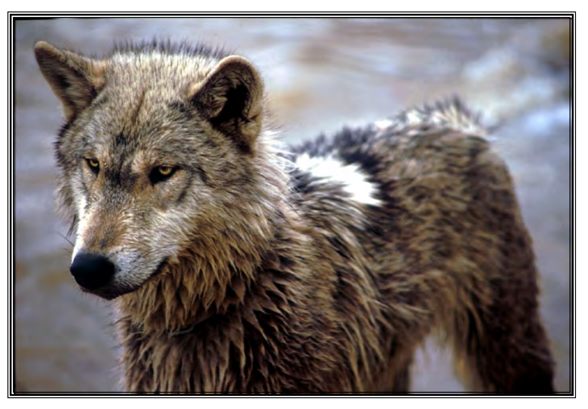
Guinness in one of his rare moments of tranquillity.