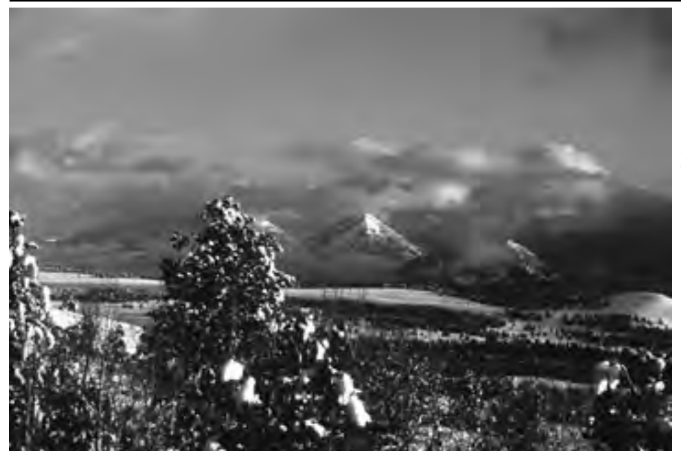
Mission: Wolf overlooks the winter wonderland wilderness of the southern Colorado Rocky Mountains.

We need staff for this winter and summer. See our web site for details.