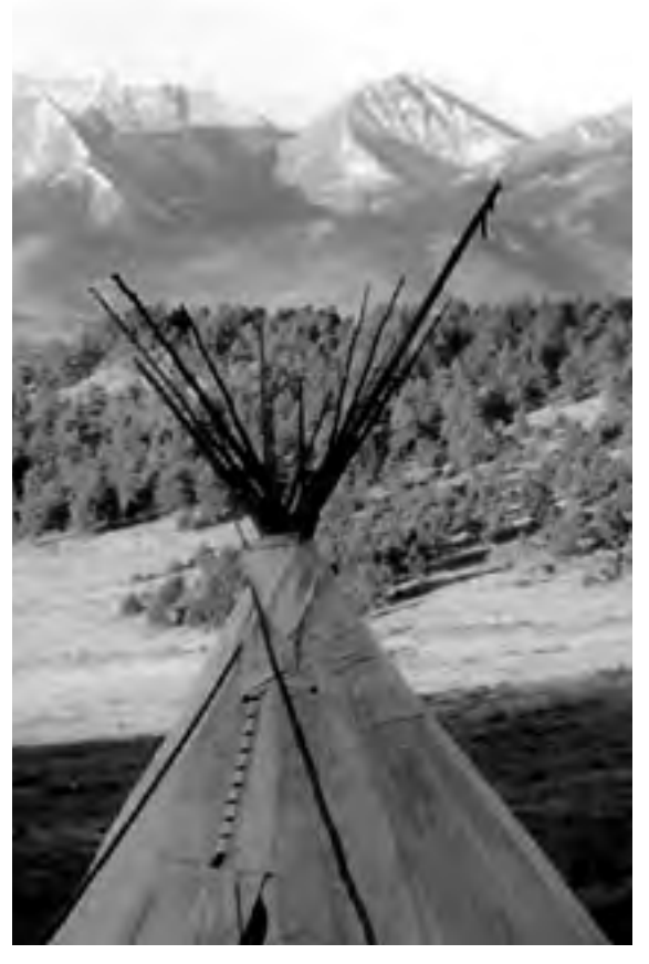
A room with a view: a tipi at Mission:Wolf

Today Rami has an accomplished resume that includes appearances on all major television networks. She was featured in National Geographic's World magazine in 1998, Outside Kid's magazine in 1999, and on National Geographic Television in 2001. Through her travels, Rami has earned the reputation of having the largest territory of any wolf in the United States. She has marked her territory from the shores of Oregon to the skyline of New York, and from the forests of the Smokies and the rolling hills of Montana to the Gulf Coast shoreline.