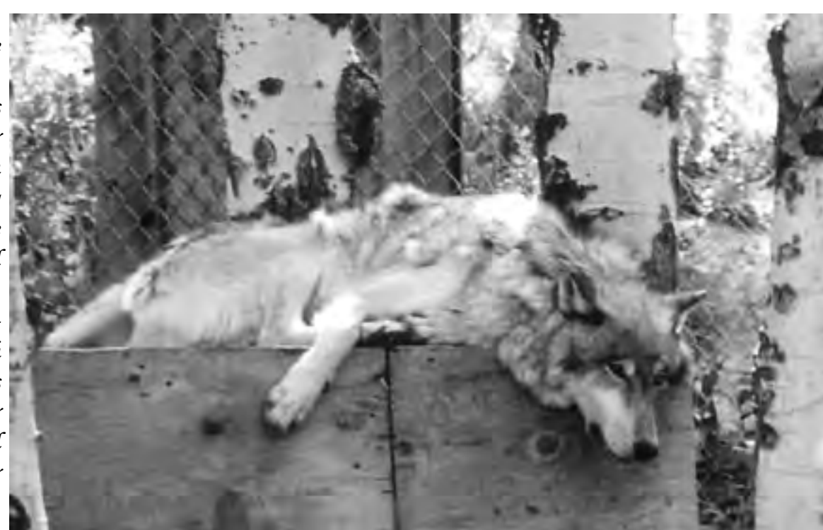
Ballazar whiles away another long, hot summer afternoon.

On the morning of March 6, 2001, staff members found Ballazar unable to stand. He was rushed to the veterinarian in Colorado Springs where he passed away on the operating table of heart failure at the age of twelve. Mera