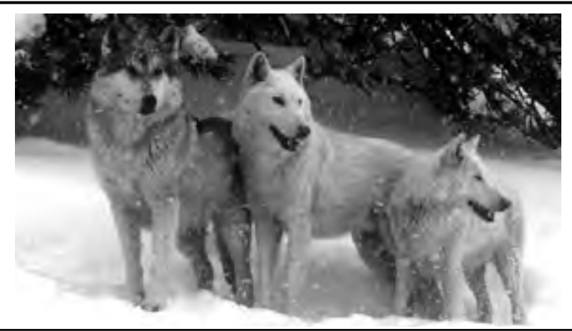
Gizmo, Lily and Polar Bear enjoy frolicking in a midwinter's snow.

Our Mission is to inspire respect for all life , be it wolf, human, plant, or insect. As people learn respect for the wolf, a creature so hated in our society, they also learn heartfelt respect for all life. Ultimately this respect is aimed at supporting the enhancement and protection of wild habitat .