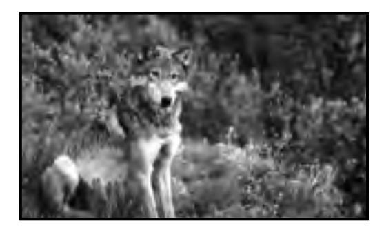
Zephyr peers down on the refuge.