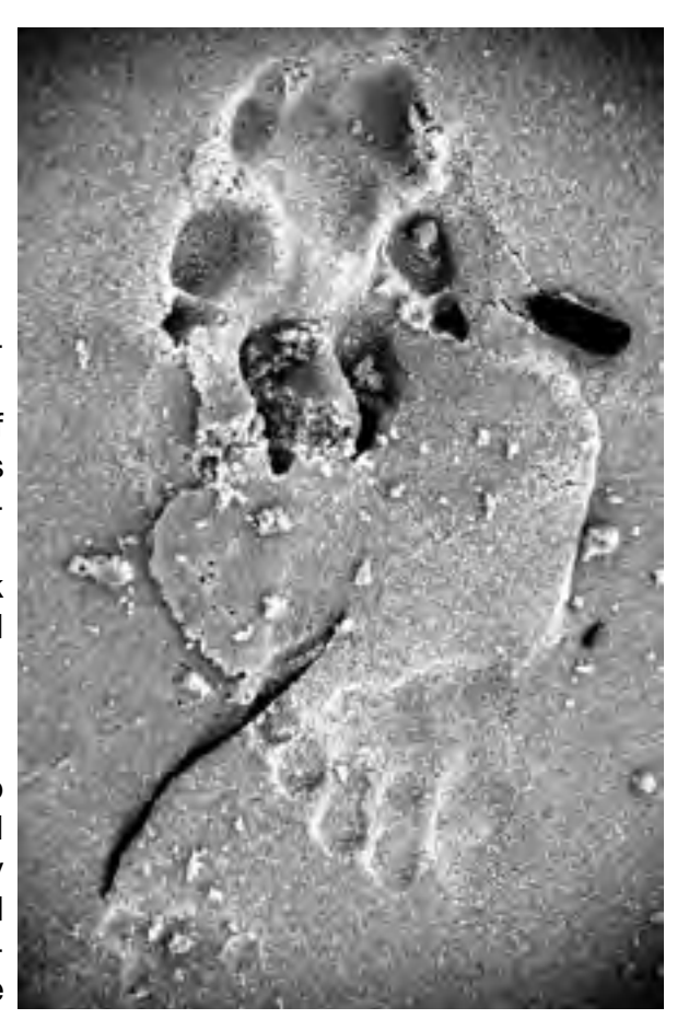
Barefoot on the beach with ambassador wolf Sila.

MEAT IS PROVIDED IN ABUNDANCE ON A NATURAL FEAST AND FAMINE SCHEDULE. TO ALLOW FOR AS NATURAL BEHAVIOR AS POSSIBLE WHILE PREVENTING THE BIRTH OF MORE PUPS, THE MALE WOLVES ARE VASECTOMIZED. THIS ALLOWS THEM THE FREEDOM TO SATISFY INSTINCTUAL MATING RITUALS WITHOUT THE COMPLICATION OF MORE WOLVES LIVING IN CAGES. MISSION:WOLF IS A CLEAR EXAMPLE OF WHY WOLVES DO NOT BELONG IN CAPTIVITY. IF WE DO OUR JOB WE HOPE TO PUT OURSELVES OUT OF BUSINESS THROUGH PUBLIC EDUCATION.