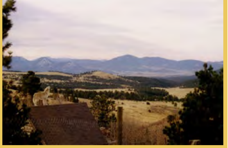
Peaches howls across the Wet Mountain Valley from the roof of our Staff Kitchen.