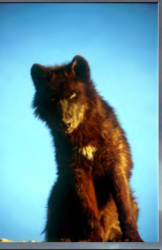
Since he was a yearling, Druid has been curious about the strange human activities in the M:W village.

erected more tipis and built a couple of small cabins. The last structure planned is the community building. This will house restrooms for both staff and visitors (goodbye smelly outhouse!) and provide the staff a large efficient kitchen and a greenhouse.