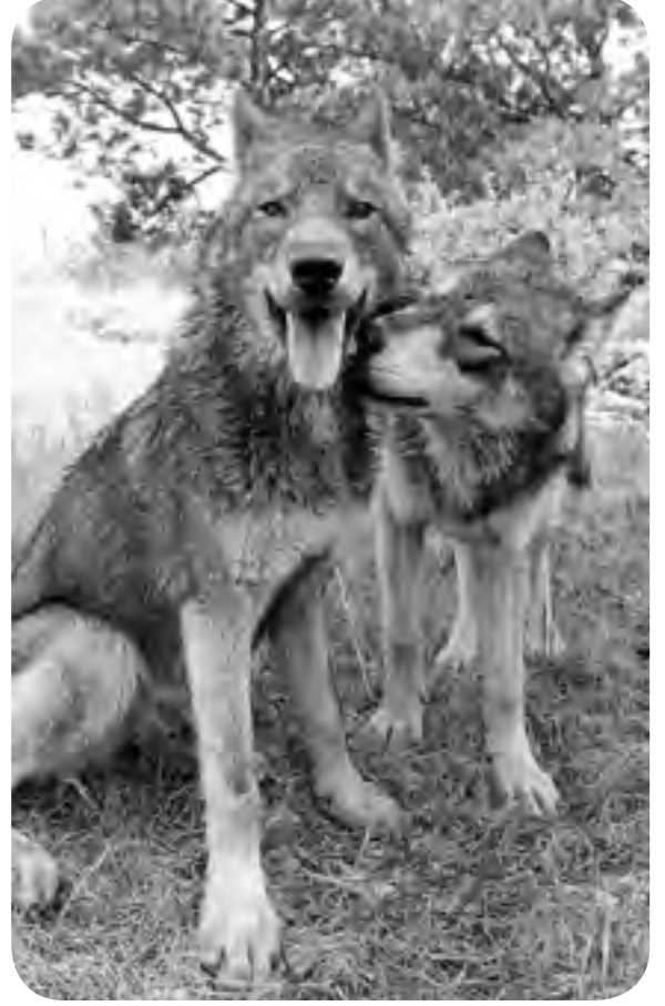
Crimzon and her brother Navarre.

With the increased need for more vet services, we see the need to create a fund for the sole purpose of paying veterinary bills. Contributions of cash and medical supplies will be dispersed from a fund established in the honor of Crimzon. The Crimzon Fund is to be used for the future care of all wolves living at M:W.